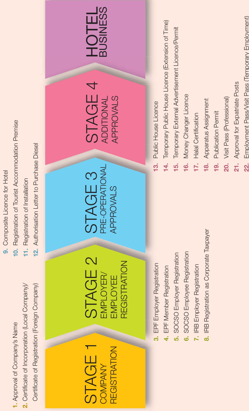
DIAGRAM 1: THE SUMMARY OF APPROVALS FOR HOTEL BUSINESS